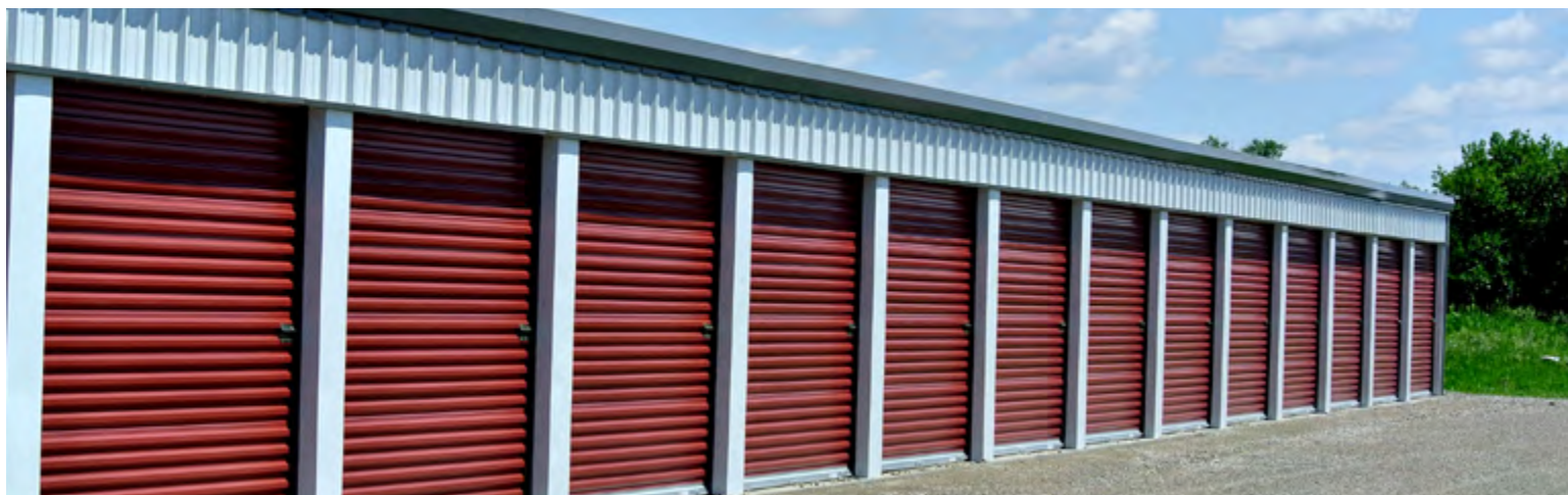
STANDARD 5:12 ROOF PITCH - SINGLE SLOPE