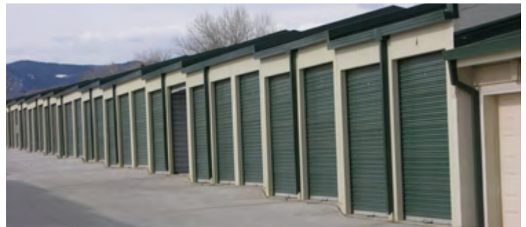
MINI STORAGE BUILDING WITH STEPS