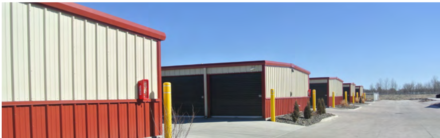
STANDARD 5:12 ROOF PITCH - GABLE