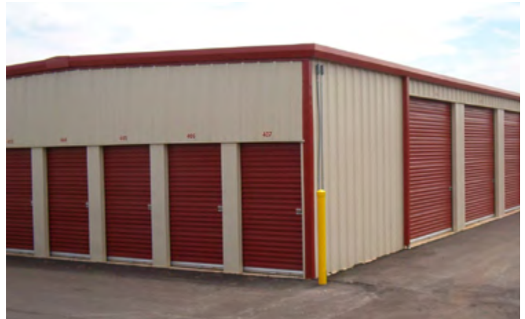
MINI STORAGE BUILDING WITH END UNITS