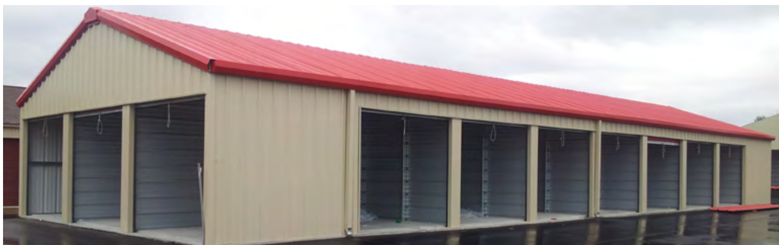
CUSTOM 4:12 ROOF PITCH - GABLE