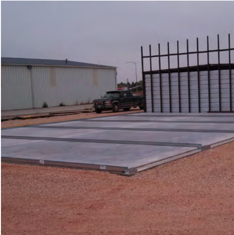
FOUNDATION WITH DOOR NOTCH AND BASE CLIP