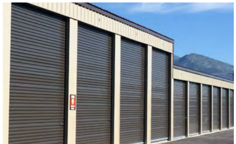
MINI STORAGE BUILDING WITH RV UNITS ATTACHED