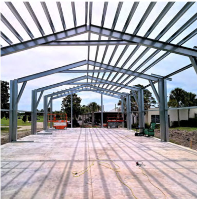
MINI STORAGE COLD FORMED BUILDING