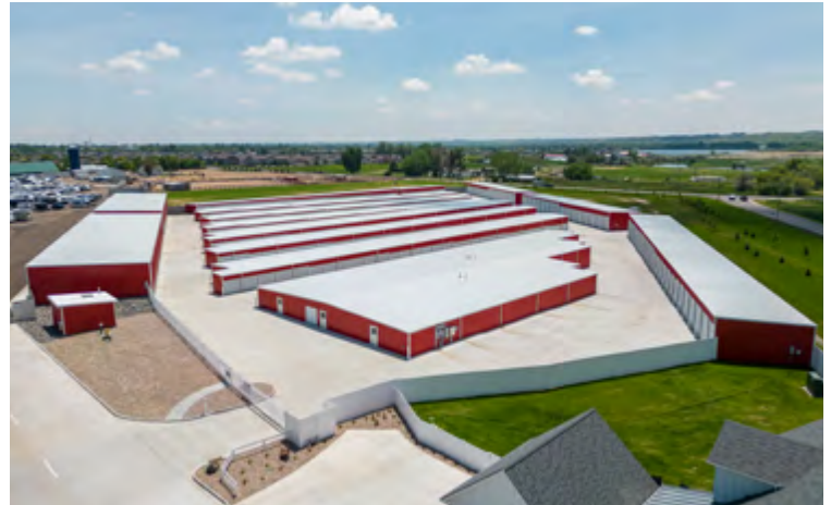
MINI STORAGE BUILDING COMPLEX